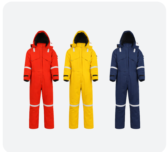
Weather Protection Wear (Rainwear & Winter Wear)

Each product can be tailored for application, climate, and branding requirements.