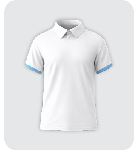
Corporate & Industrial Shirts