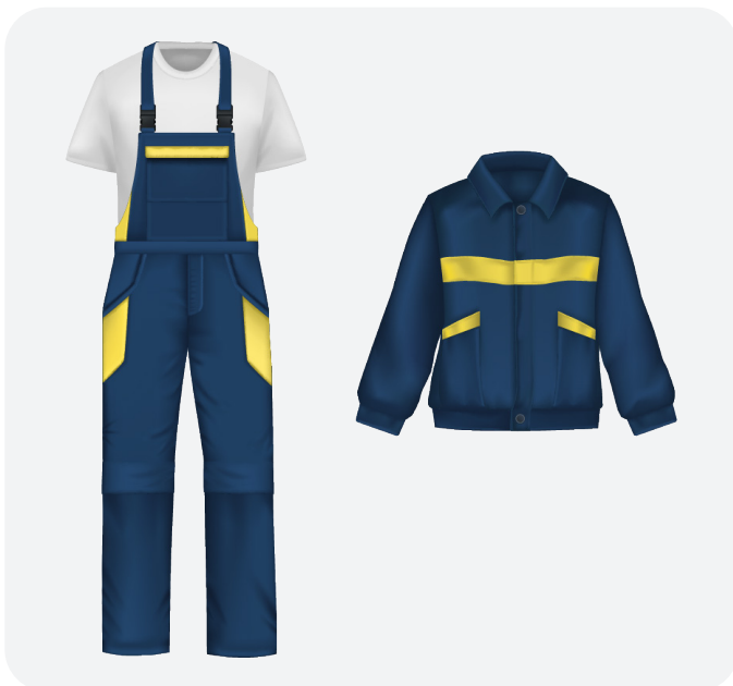
Industrial Utility Wear