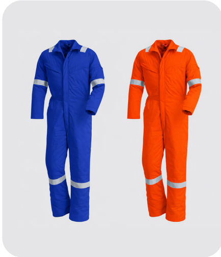
Industrial Coveralls & Boiler Suits

Our product range is designed to address everyday industrial safety and operational requirements: