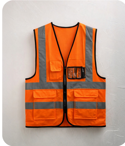
High-Visibility Jackets & Reflective Vests